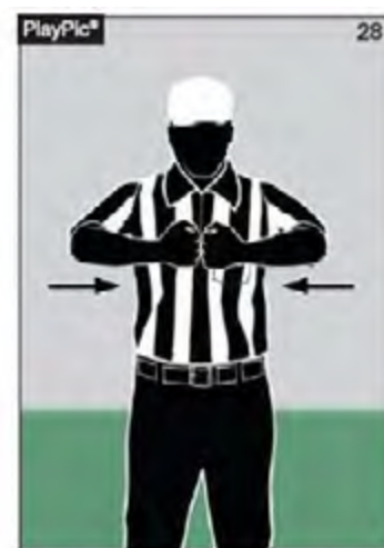
Illegal blindside block

• Addition of Signal 28 for Illegal Blindside Block: