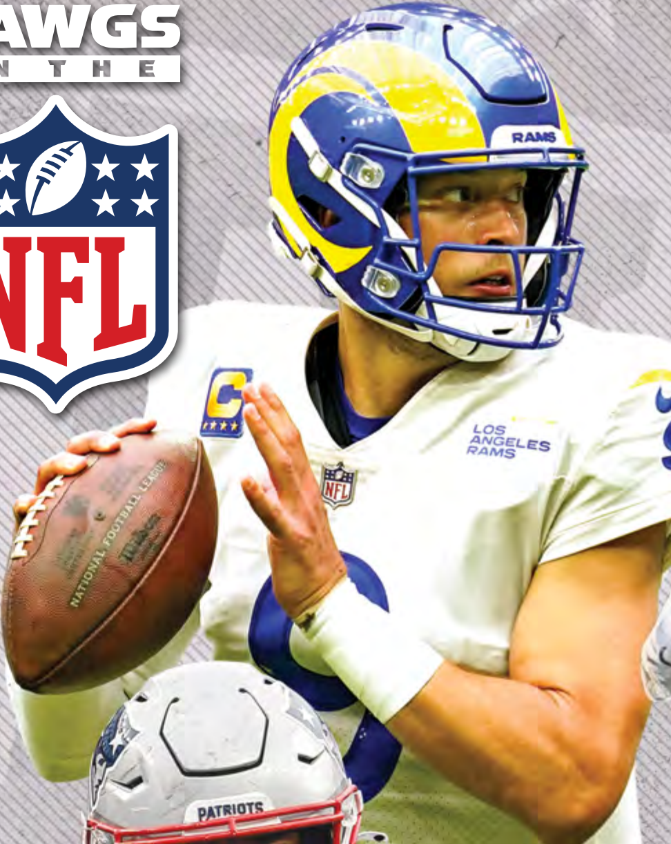
Matthew Stafford, QB Los Angeles Rams