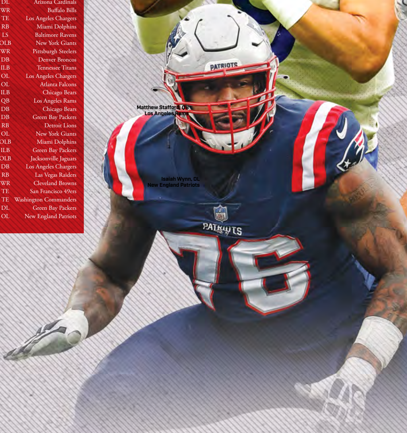
Isaiah Wynn, OL New England Patriots