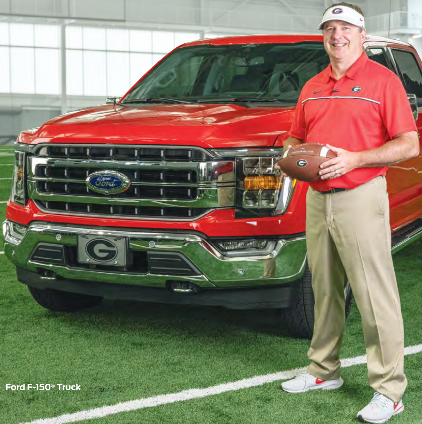
Ford F-150® Truck