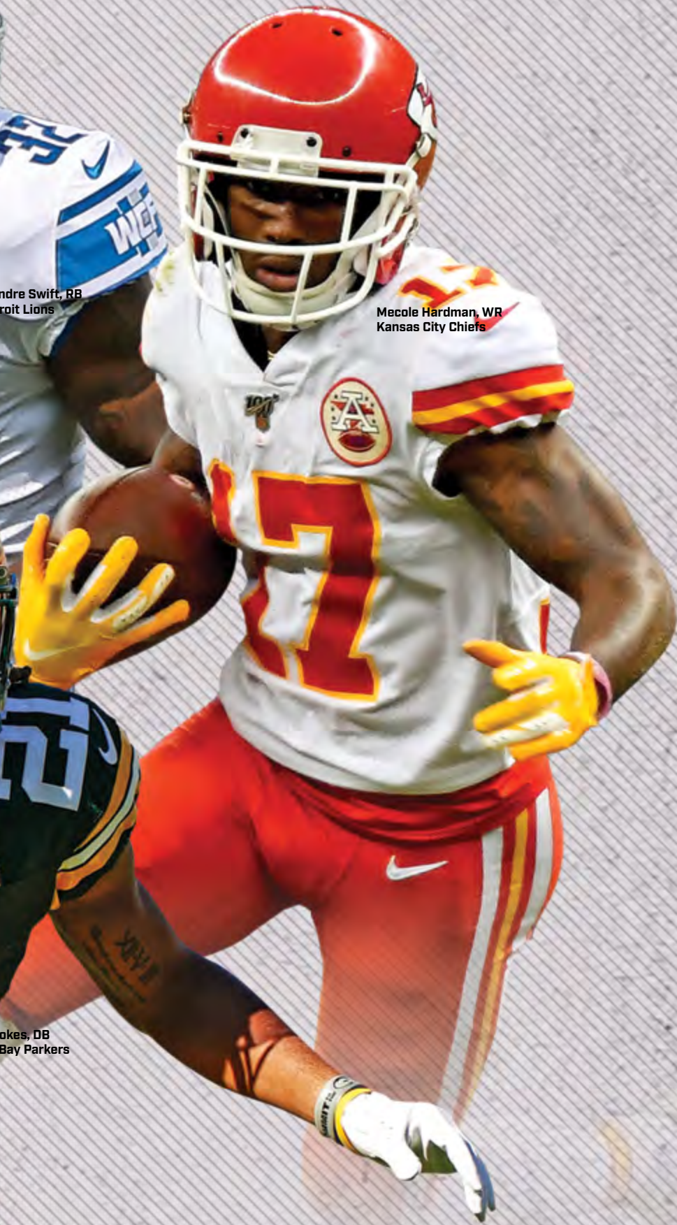
Mecole Hardman, WR Kansas City Chiefs