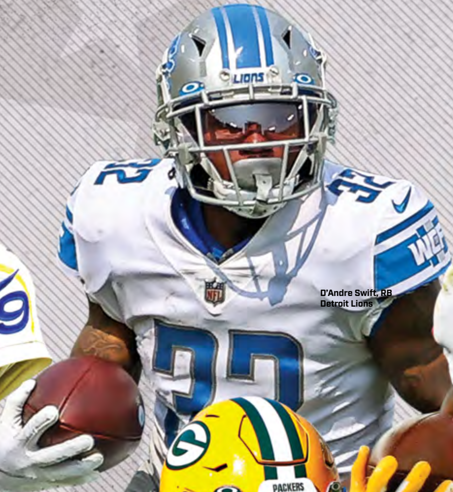
D'Andre Swift, RB Detroit Lions